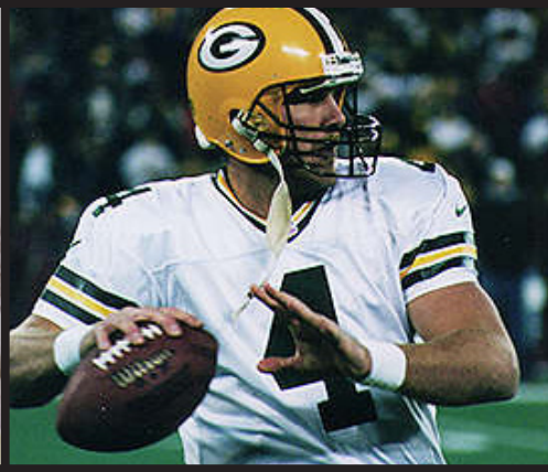
Brett Favre University of Southern Mississippi