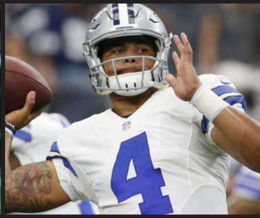
Dak Prescott Mississippi State University