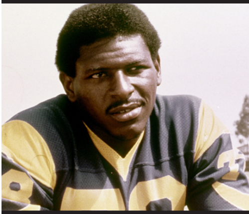
Jackie Slater Jackson State University